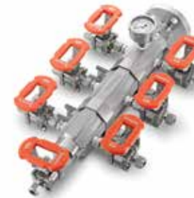
Fluid Distribution Header (FDH) Catalog - MS-02-358

Minimize system footprint and simplify system design with our series of predesigned and preassembled, easy-to-install and -operate subsystems for use in all types of plants and facilities where fluids are being processed.