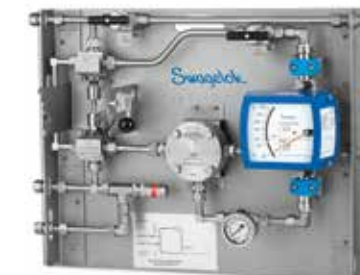
Fast Loop Module (FLM) Catalog - MS-02-361