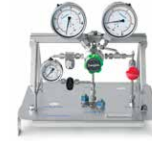
Field Station Module (FSM) Catalog - MS-02-359