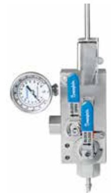
Sample Probe Module (SPM) Catalog - MS-02-425